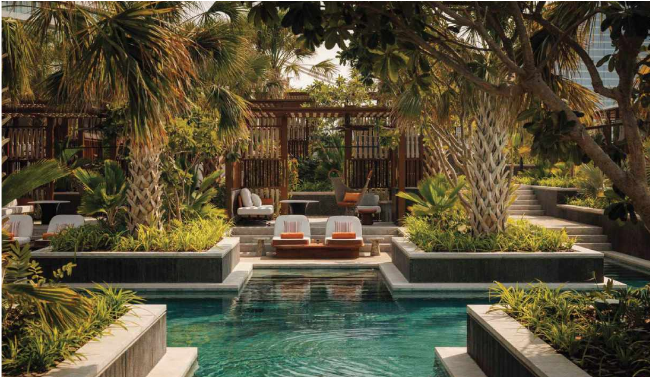
Jumeirah Marsa Al Arab Beach & Pool Bars