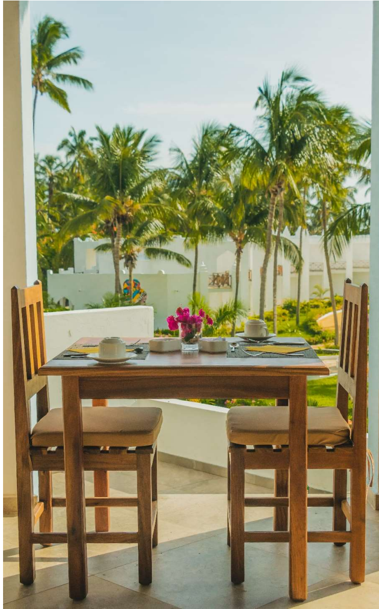
Restaurants & Bars