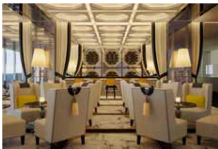
Cuvee - Bar Lounge

Take a break and indulge in a wide selection of tea and coffee in an elegant ambience of our lobby cafe. Daily, from 9am to 6pm.