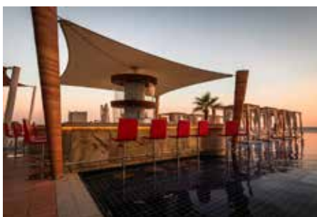
The View - Pool Bar

Indulge in style at poolside while enjoying the nice weather and a cold drink at the pool bar.