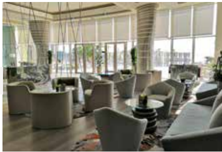
Lobby14 - Lobby Cafe

Relax in the tranquil ambience of Mondo Shisha Lounge and delight in the wide selection of exotic aromas of shisha. Daily, from 5pm to 2am.