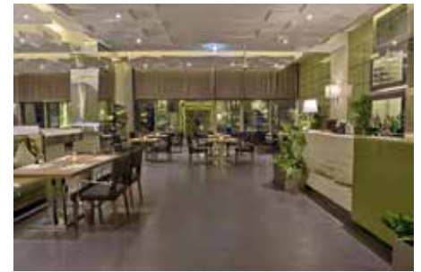
Celebrity - Speciality Restaurant

The Celebrity restaurant is a highly sought-after dining spot that is currently only open on Tuesday evenings our famous Sushi night.