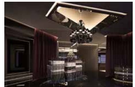
R55 - Night Club

Thoughtful and contemporary, beautifully designed 2-story nightclub with an inspiring design and luxury details, overlooking the hotel's private marina, offering guests a combination of excitement and entertainment.