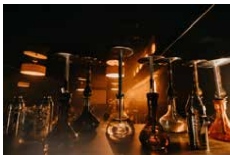
Mondo - Shisha Lounge

Relax in the tranquil ambience of Mondo Shisha Lounge and delight in the wide selection of exotic aromas of shisha. Daily, from 5pm to 2am.