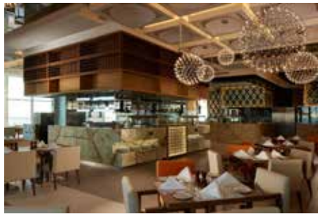
Mezze - All Day Dining

The hotel's main restaurant, Mezze is a modern all-day-dining concept with an indoor and outdoor areas, serving a variety of international cuisines including oriental, asian and european, in a buffet setting as well as a la carte options.