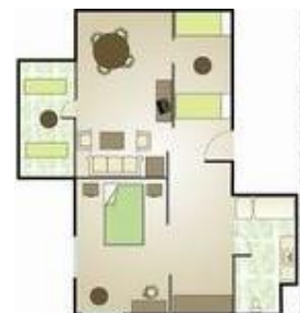
Junior Suite Room