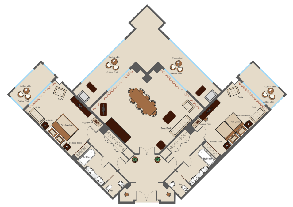
130m². 2 bedrooms with balconies, bath with hydro massage, a magnificent lounge and a tekka floor terrace with sun beds. Minimum occupancy 4 adults, maximum 4 adults and 2 children.