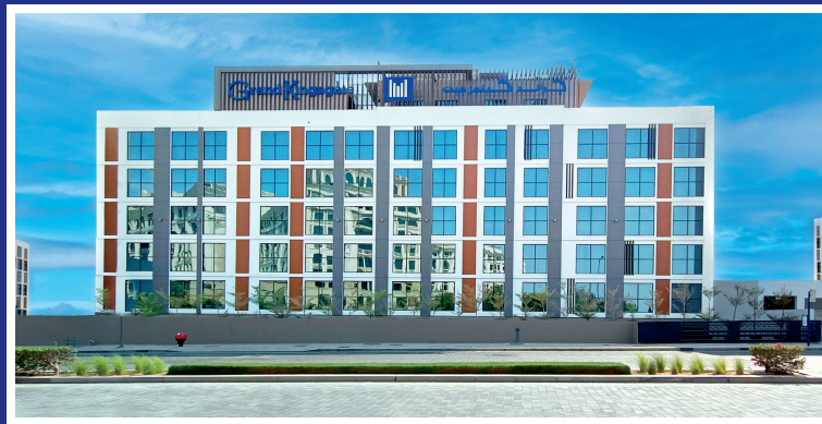
GRAND KINGSGATE WATERFRONT HOTEL