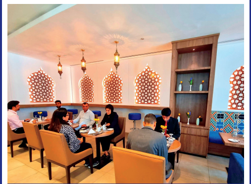
ARABESQUE JADAF Arabic Cuisine