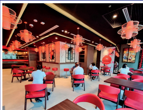
THE RED EAST Chinese Cuisine & Sushi