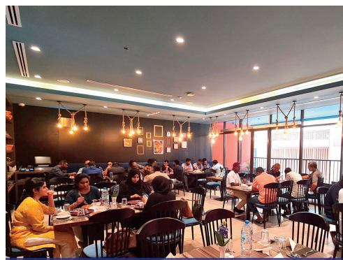
INDIHOUSE Authentic Indian Cuisine