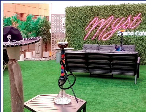
MYST SHISHA CAFE In / Outdoor