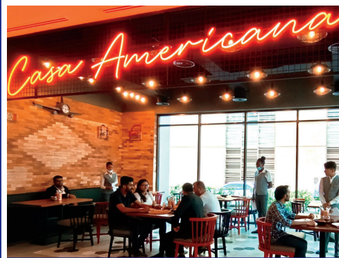
CASA AMERICANA Italian & American Cuisine