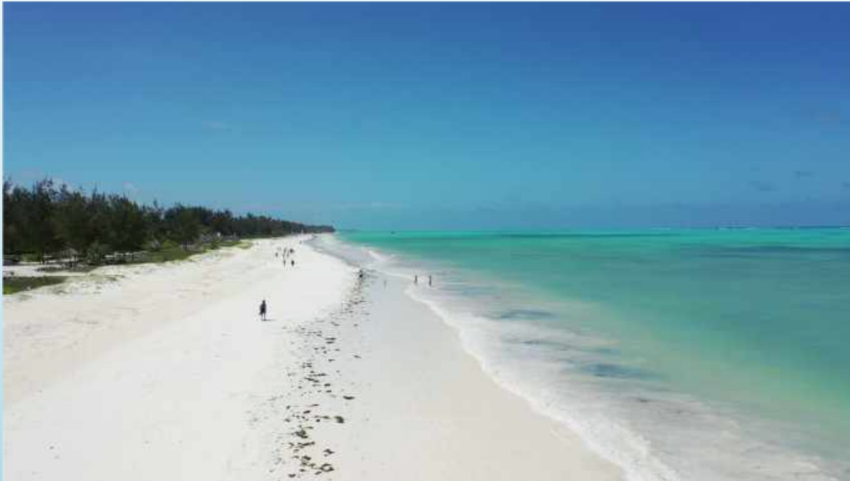
Left side of Amani