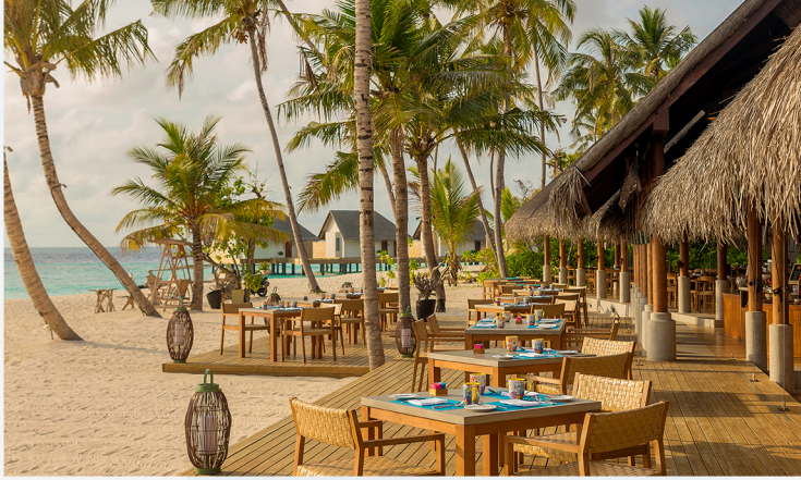
Korakali - Main Restaurant

At Fushifaru, all of our dining outlets are fused with nature so that you enjoy fantastic concoctions while facing scenic Maldivian beauty. To top your dining experience off, our outlets burst with regional and international flavours, and are tailored to every taste, need and dietary requirement. If you want to try one of these experiences please email reservations@fushifaru.com