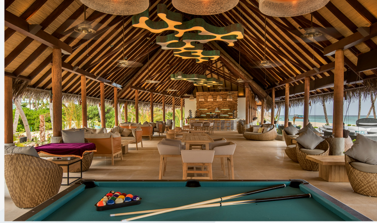
Fanihandi Bar - Main Bar

Fanihandi is our main bar on the island where guests can savour our signature cocktails, mocktails, tea and coffee or even a fresh Kurumba from our local coconut trees.