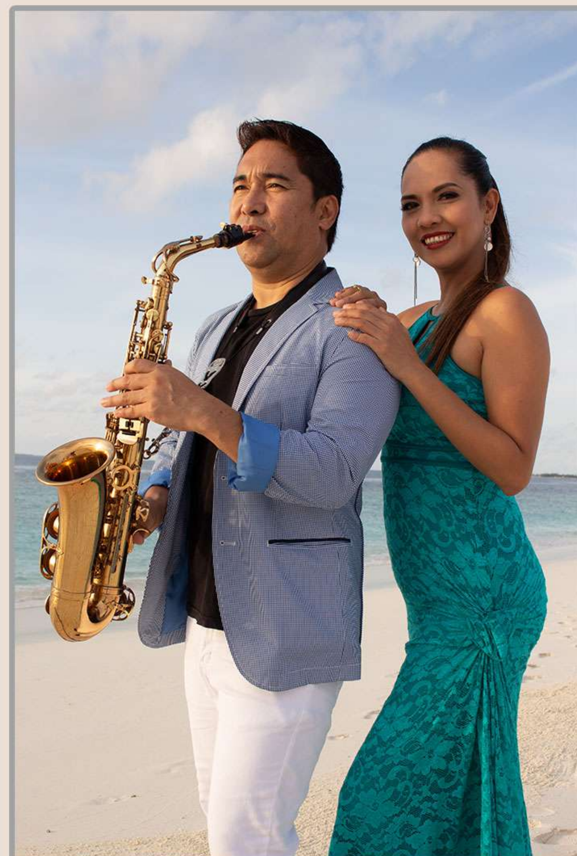
- Beatus Duo -