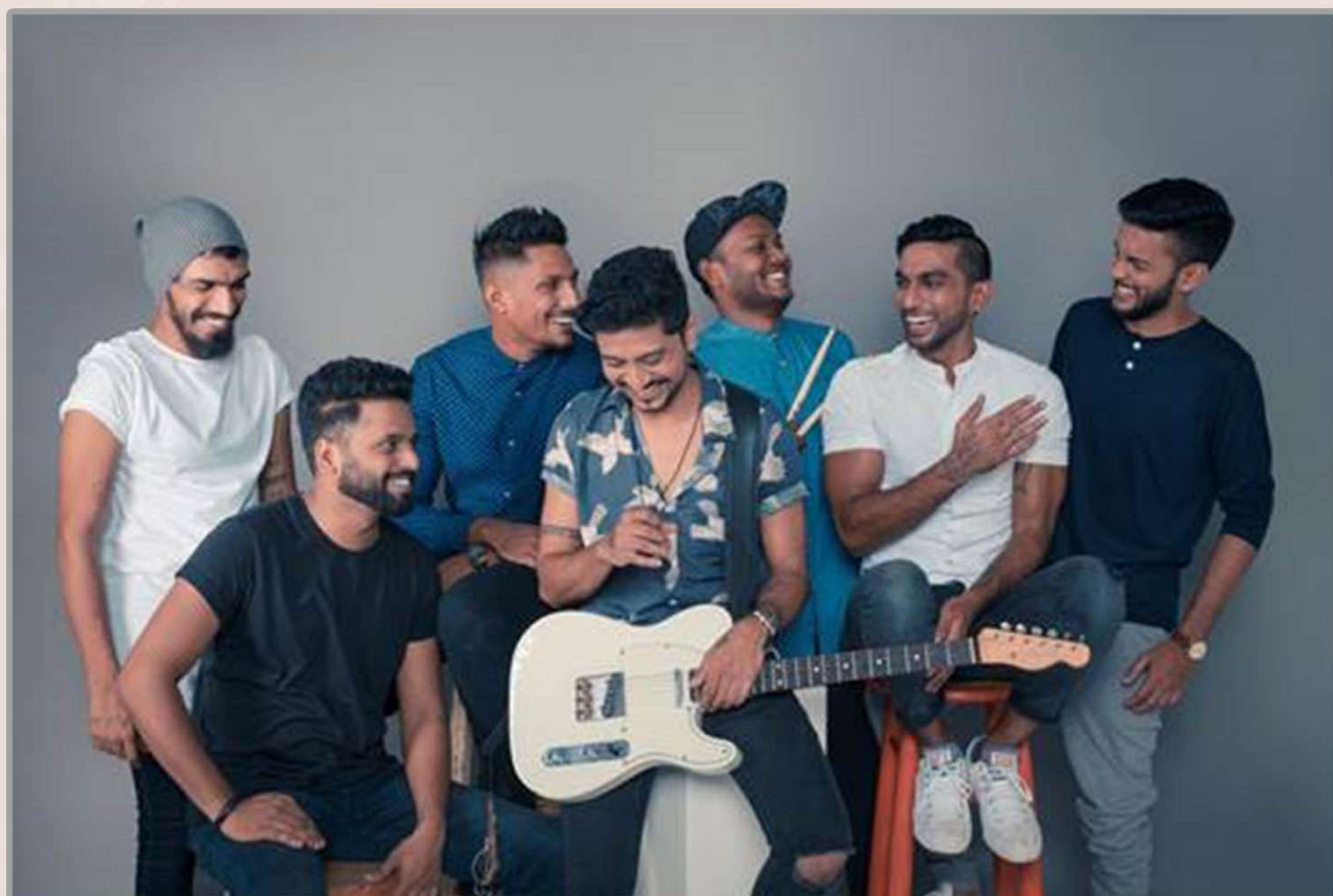
- Magic Box MixUp -