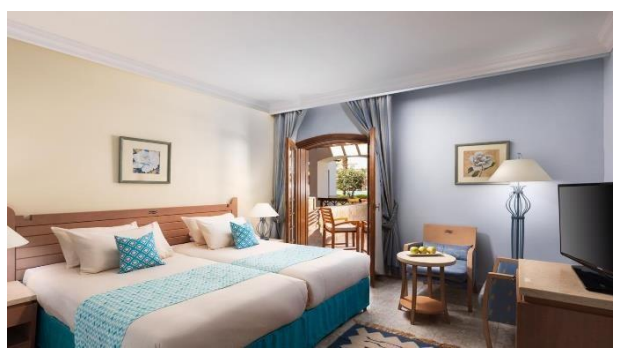
36 sq. with pool and garden view (balcony or terrace), king or twin bed