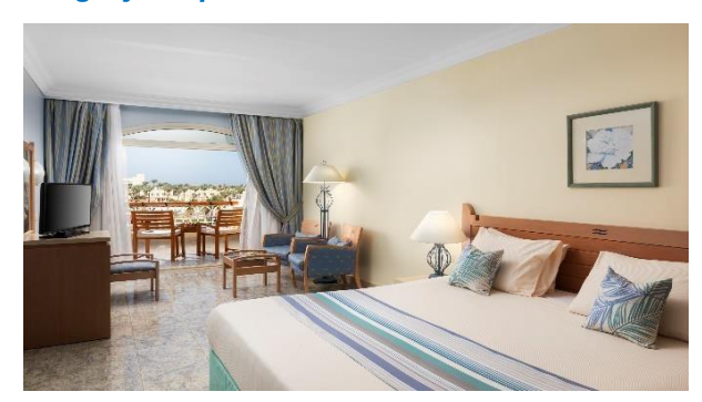
38 sq. with pool view (balcony or terrace), king or twin bed