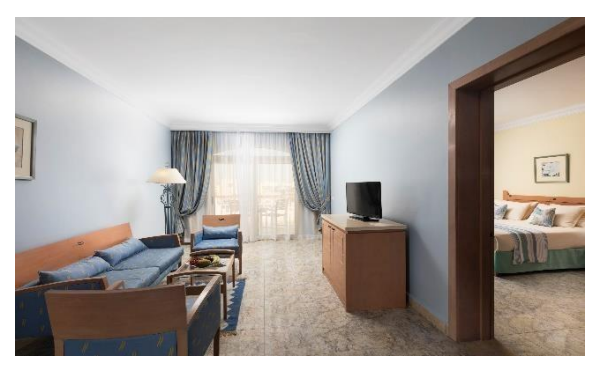
70 sq. with pool view (balcony or terrace), king bed, one bedroom, one living room; 2 bathroom

Each room including: safe box, phone, TV with English, Polish, Arabic, Russian channels, empty mini bar, 1 small bottle of water per each adult guest every day, air condition, kettle, 1 or 2 extra bed.