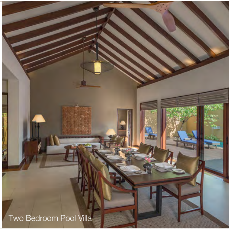
Two Bedroom Pool Villa