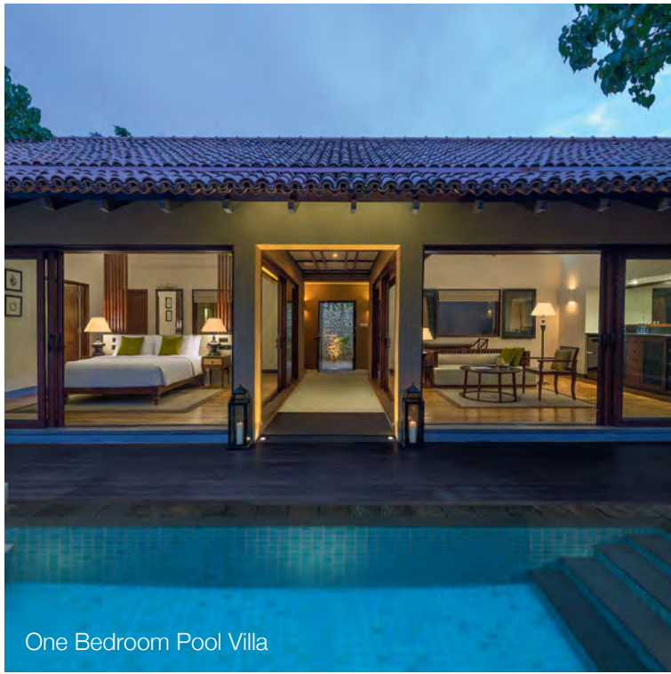
One Bedroom Pool Villa