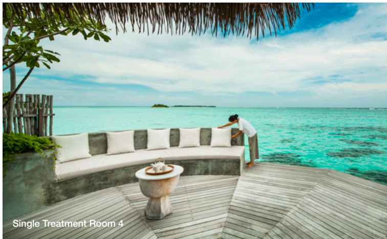
Single Treatment Room 4