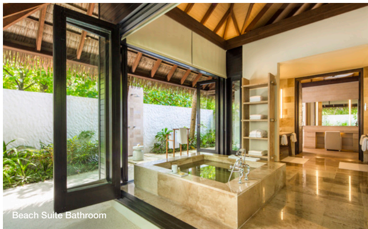
Beach Suite Bathroom