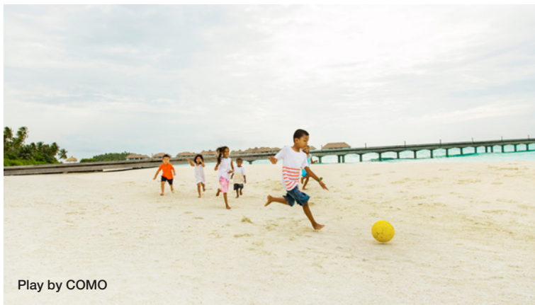
Play by COMO