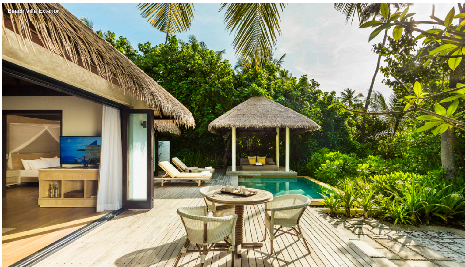
Beach Villa Exterior