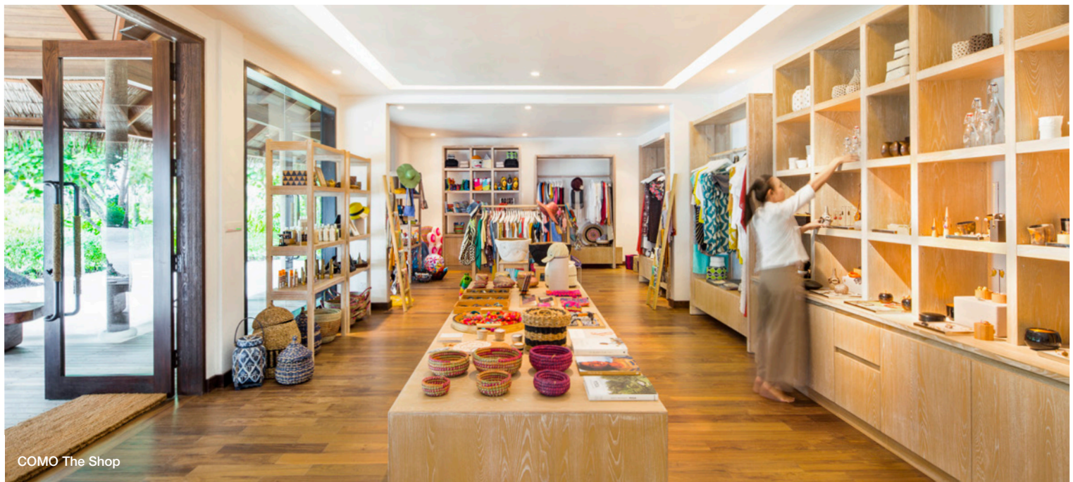
COMO The Shop