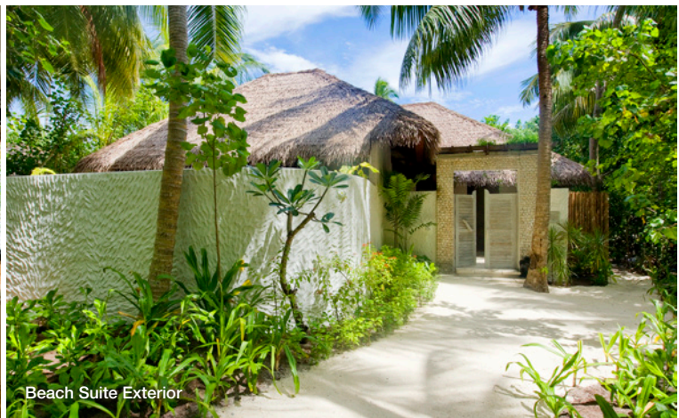
Beach Suite Exterior