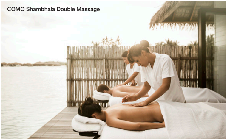
COMO Shambhala Double Massage