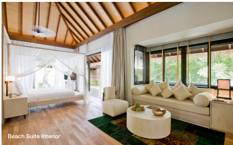
Beach Suite Interior