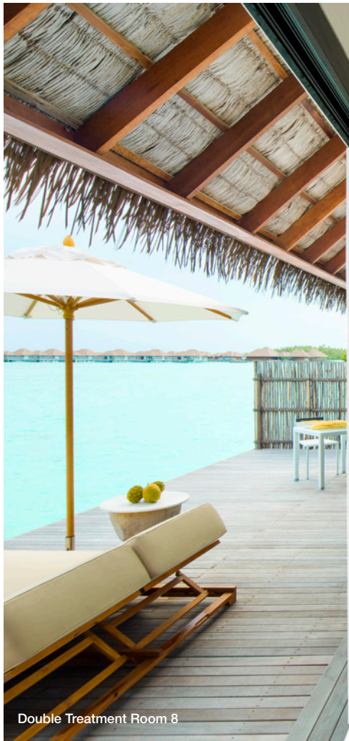
Double Treatment Room 8