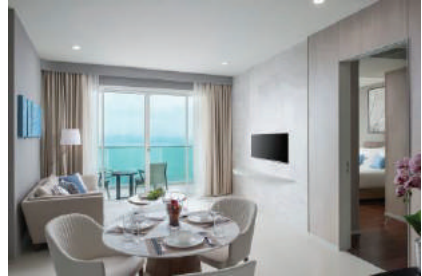
ONE BEDROOM : 59 - 80 Sqm., King Bed with seperated Living Area and Full Kitchenette