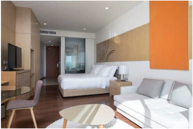
STUDIO: 50 Sqm. with King or Twin Beds