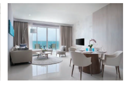
EXECUTIVE TWO BEDROOMS : 142 Sqm., 2 Bedrooms and 2 Bathrooms with King Bed and 2 Single Beds with seperated Living Area and Full Kitchenette