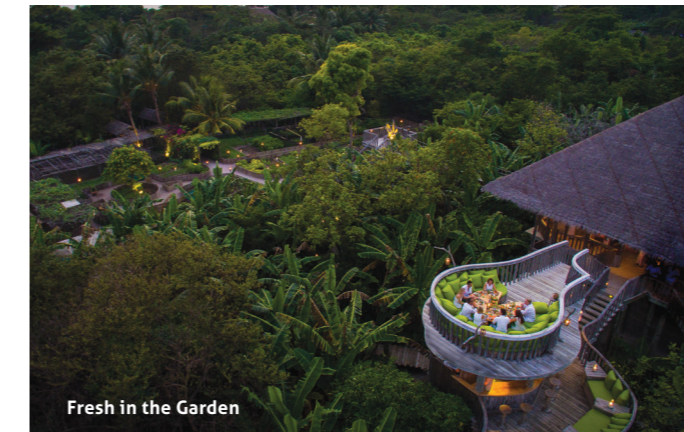
Fresh in the Garden

Lunch & Dinner: Open Mondays, Wednesdays, Thursdays, Fridays and Sundays