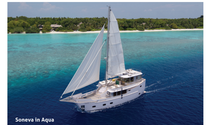
Soneva in Aqua

A luxurious floating villa that sets sail from Soneva Fushi, Soneva in Aqua affords guests the luxury of three charter routes that sail around and beyond the Baa Atoll. Guests can choose between one, two and three-night excursions depending on how much of the awe-inspiring sights of the Indian Ocean they wish to explore.