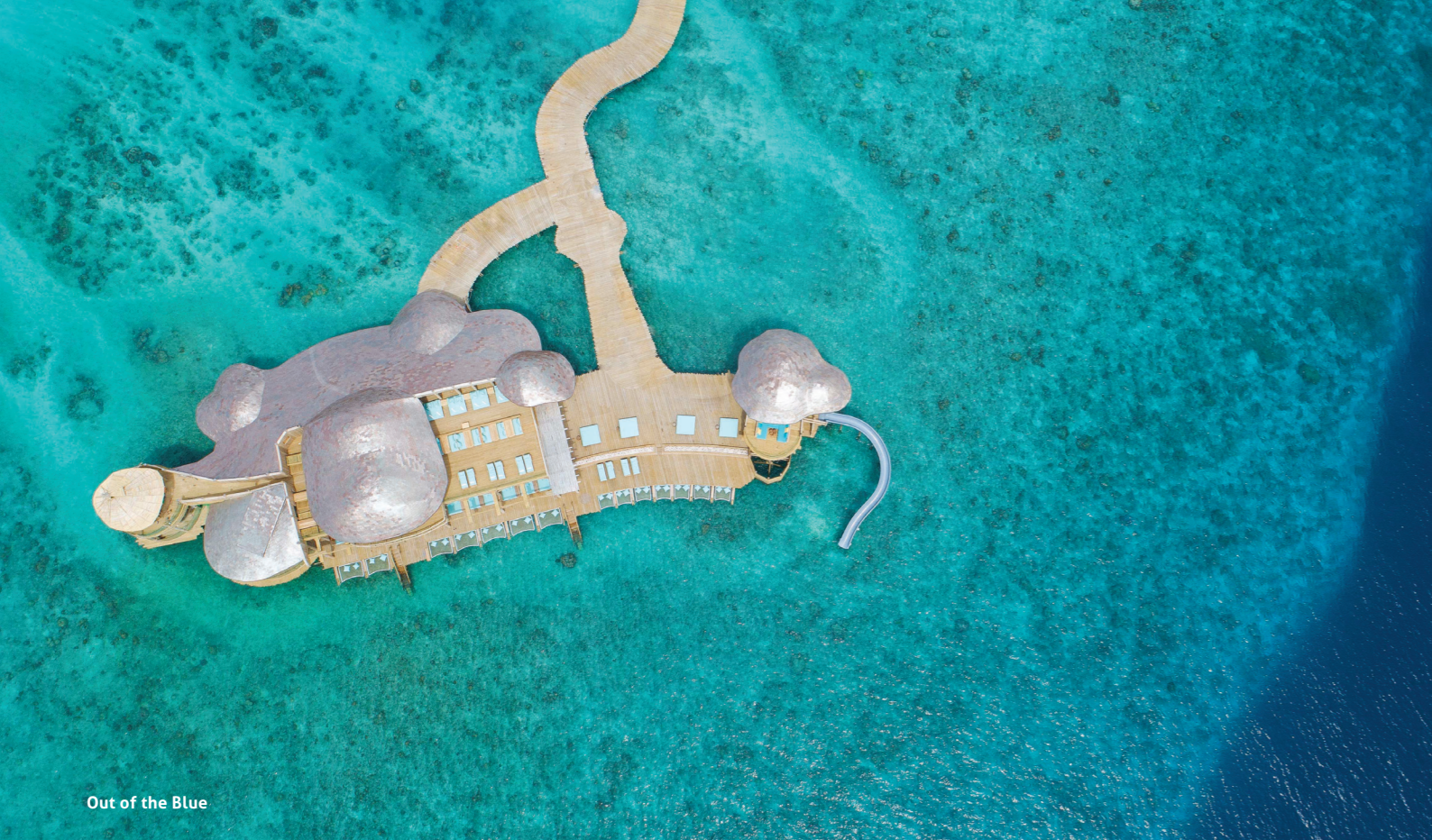
Out of the Blue