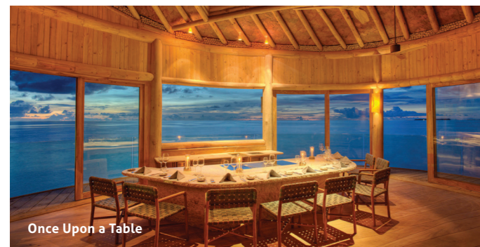
Once Upon a Table

Dinner: Open Mondays, Wednesdays, Thursdays, Fridays, Sundays