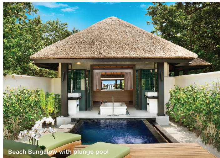
Beach Bungalow with plunge pool