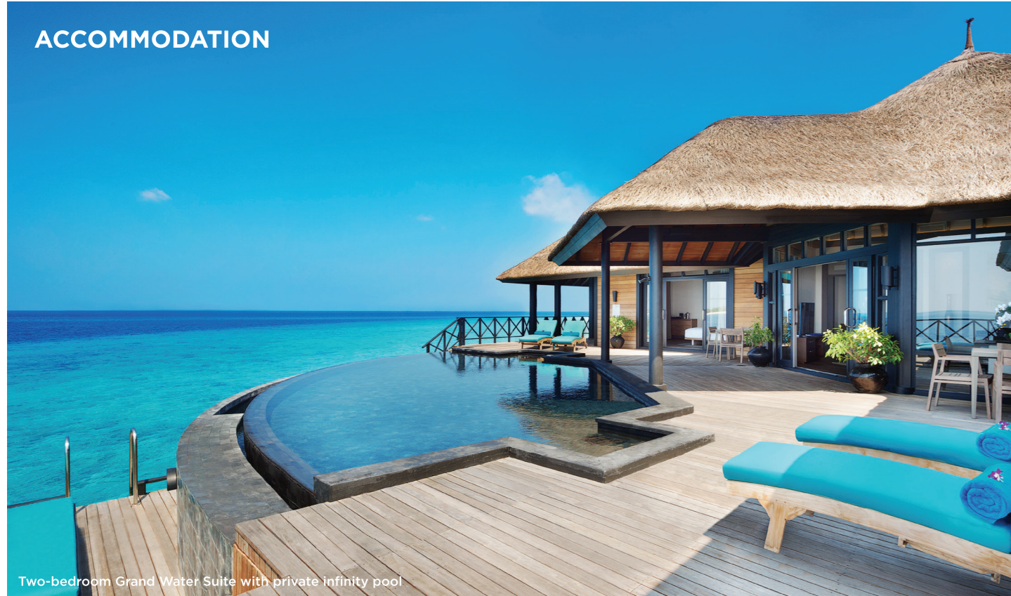
Two-bedroom Grand Water Suite with private infinity pool