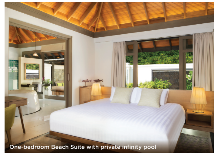
One-bedroom Beach Suite with private infinity pool