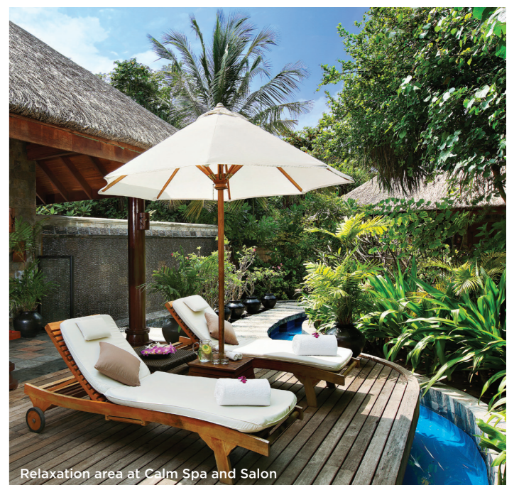
Relaxation area at Calm Spa and Salon