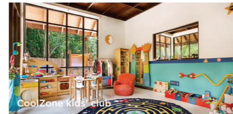
CoolZone kids' club