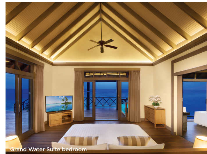
Grand Water Suite bedroom