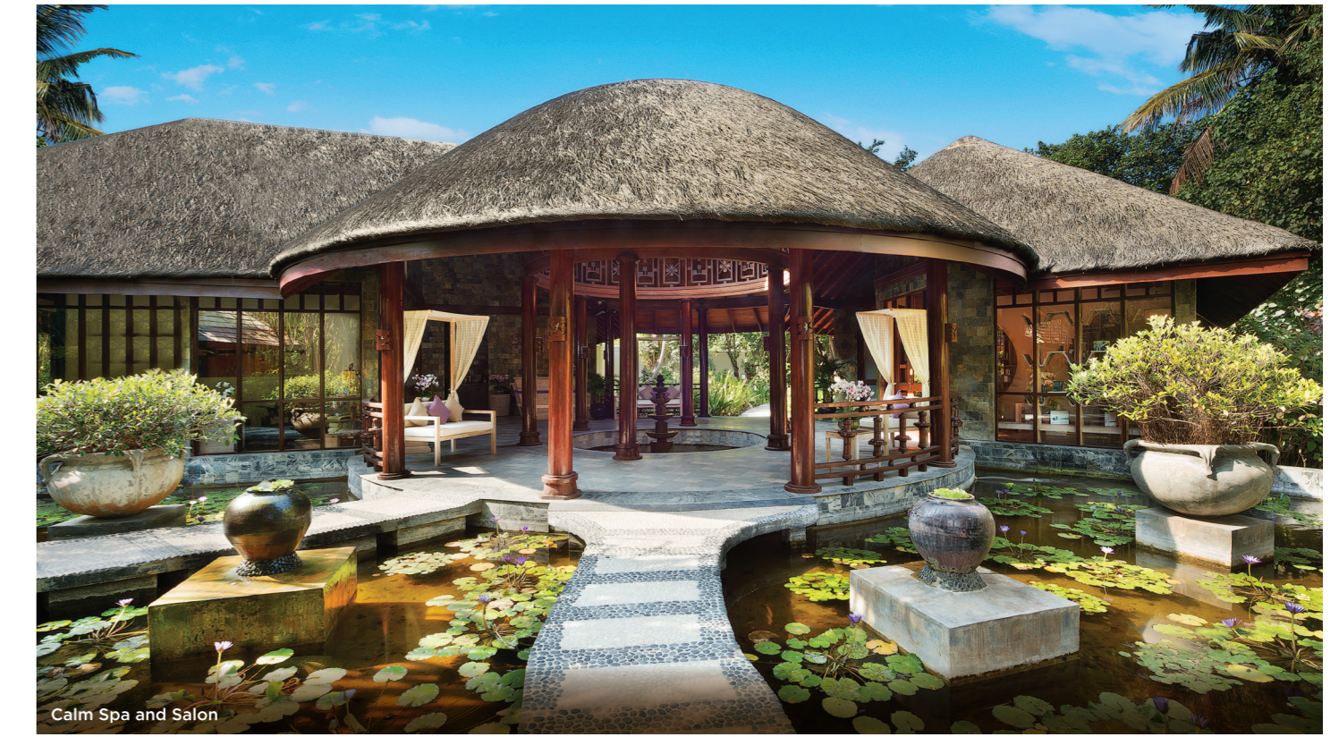
Calm Spa and Salon

Find your chi, meditate in island bliss and discover tailor-made fitness programmes with your very own private instructors at our tropical island pavilion.