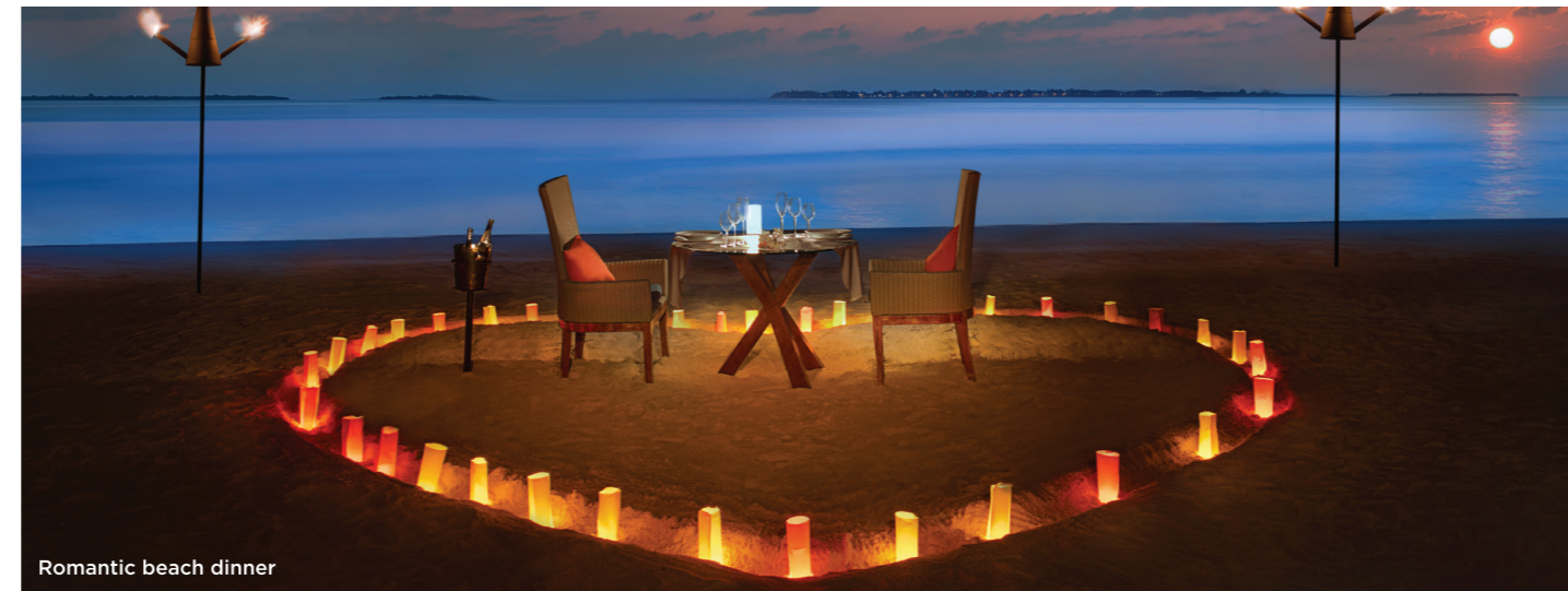
Romantic beach dinner