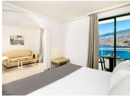
PRIVILEGE JUNIOR SUITE