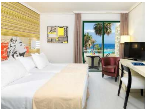
SEA VIEW DOUBLE ROOM

Basic Rooms: comfortable smaller-sized rooms accommodating up to two people. They feature two 1 x 2 m twin beds. They have either street views or pool views (no balcony).