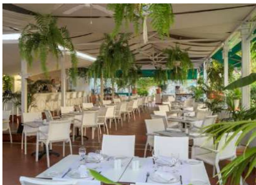
EL LAGAR BAR AND RESTAURANT

El Drago: buffet restaurant with show cooking and large windows overlooking the sea. It features a pleasant terrace with spectacular sea views.