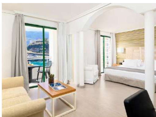
SEA VIEW PRIVILEGE JUNIOR SUITE

Junior Suites: spacious 39 m 2 rooms with bedroom, living room and balcony overlooking the street and the swimming pool. Featuring either one 2 x 2 m King Size bed or two 1 m x 2 m twin beds. They feature a sofa bed and can accommodate up to 2 adults + 2 children.