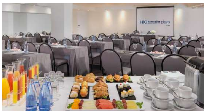
TROPICAL ROOM – CLASSROOM LAYOUT WITH COFFEE-BREAK

*Maximum (optimal) capacity recommended for these rooms by event type. During the health crisis, the capacity will be reduced and the layouts will be adapted to guarantee the safety distance and hygiene measures.