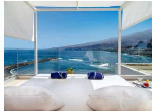
BALINESE BEDS OVERLOOKING THE SEA