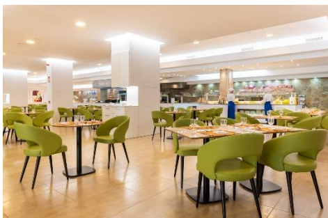
Restaurant "El Amarre"