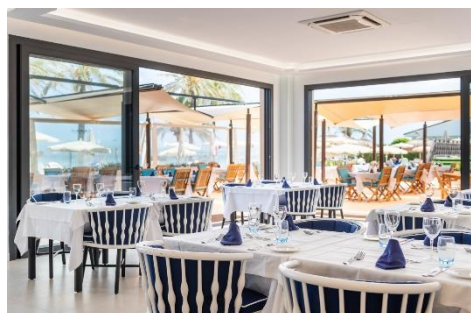
Restaurant "Don Jaime"