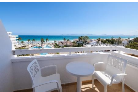
Double Side Sea View Room Double Frontal Sea View Room