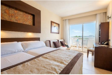
Double Basic / Double room