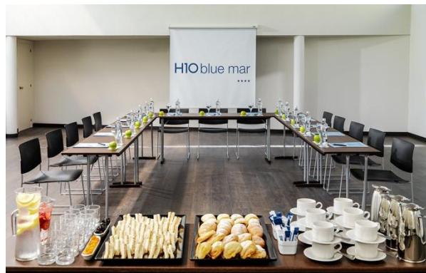
SA LLUM ROOM – "U" LAYOUT