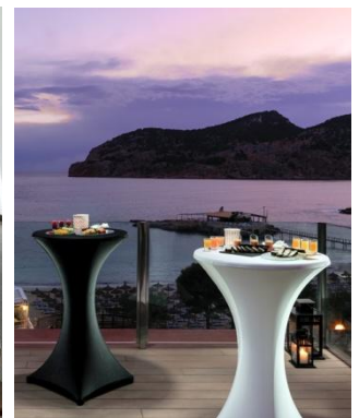
DRINKS RECEPTION WITH SEA VIEWS