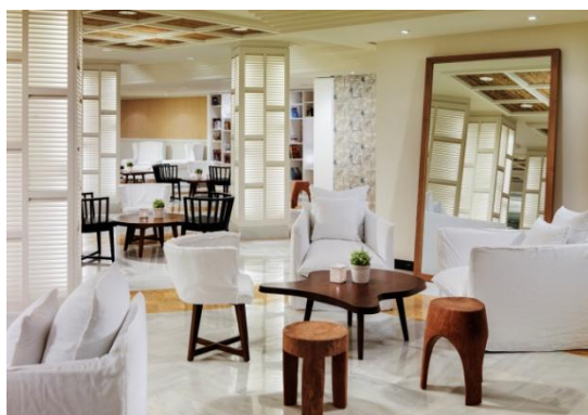
WHITE AND BLUE BAR

Sa Calma Restaurant: a beautiful restaurant with exterior windows, overlooking the swimming pool. It offers a buffet breakfast and a varied snack menu throughout the day. For dinner, the restaurant has an à la carte service with a delicious variety of high quality local produce served as a starter, a main course and a dessert.