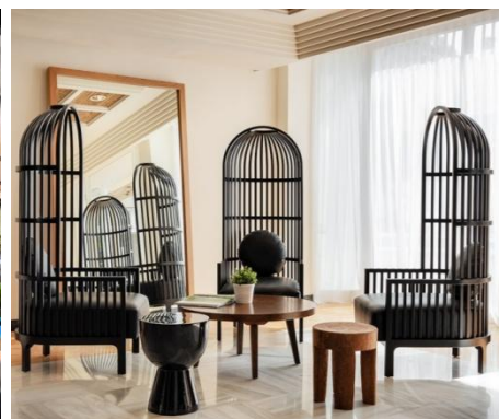
CORNER OF THE LOBBY