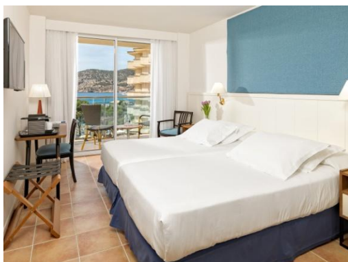
SUPERIOR DOUBLE ROOM

Double Rooms: comfortable rooms with a balcony and side view of the sea. They can accommodate up to 2 adults.