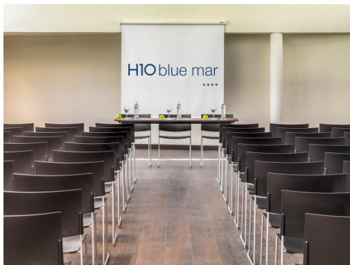
SA LLUM ROOM – THEATRE LAYOUT

* Recommended (optimum) maximum capacity for these rooms by event type.