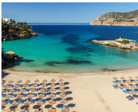
CAMP DE MAR BEACH IN FRONT OF THE HOTEL

The rooms all have top-of-the-range amenities to guarantee a perfect stay. For more information, see the Rooms section.