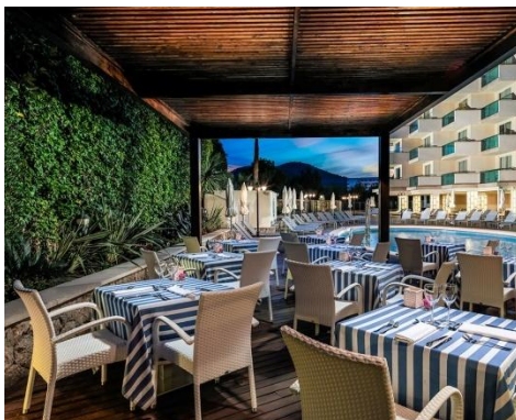
SA CALMA RESTAURANT TERRACE