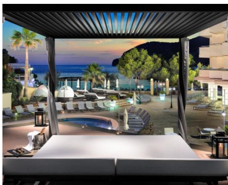
CHILL-OUT TERRACE WITH SEA VIEWS