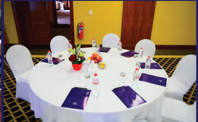
Ramses 8 Delegates