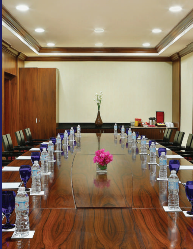
Nefertiti 20 Delegates