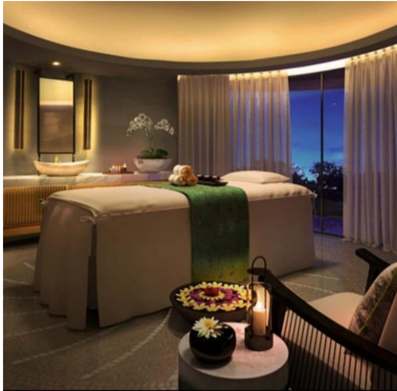
Spa Treatment room