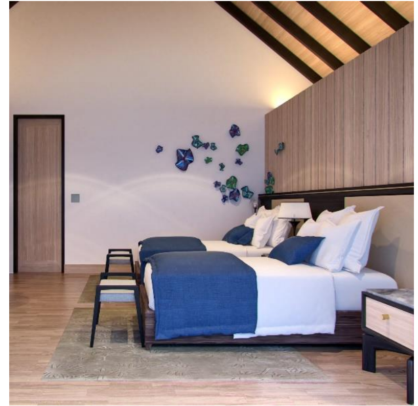
2nd Bedroom – Twin Bed

Available in 2 bedroom and 3 bedroom Beach Villas