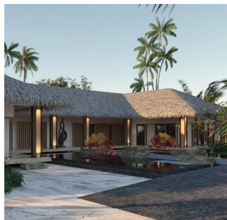
Entertainment Area Exterior