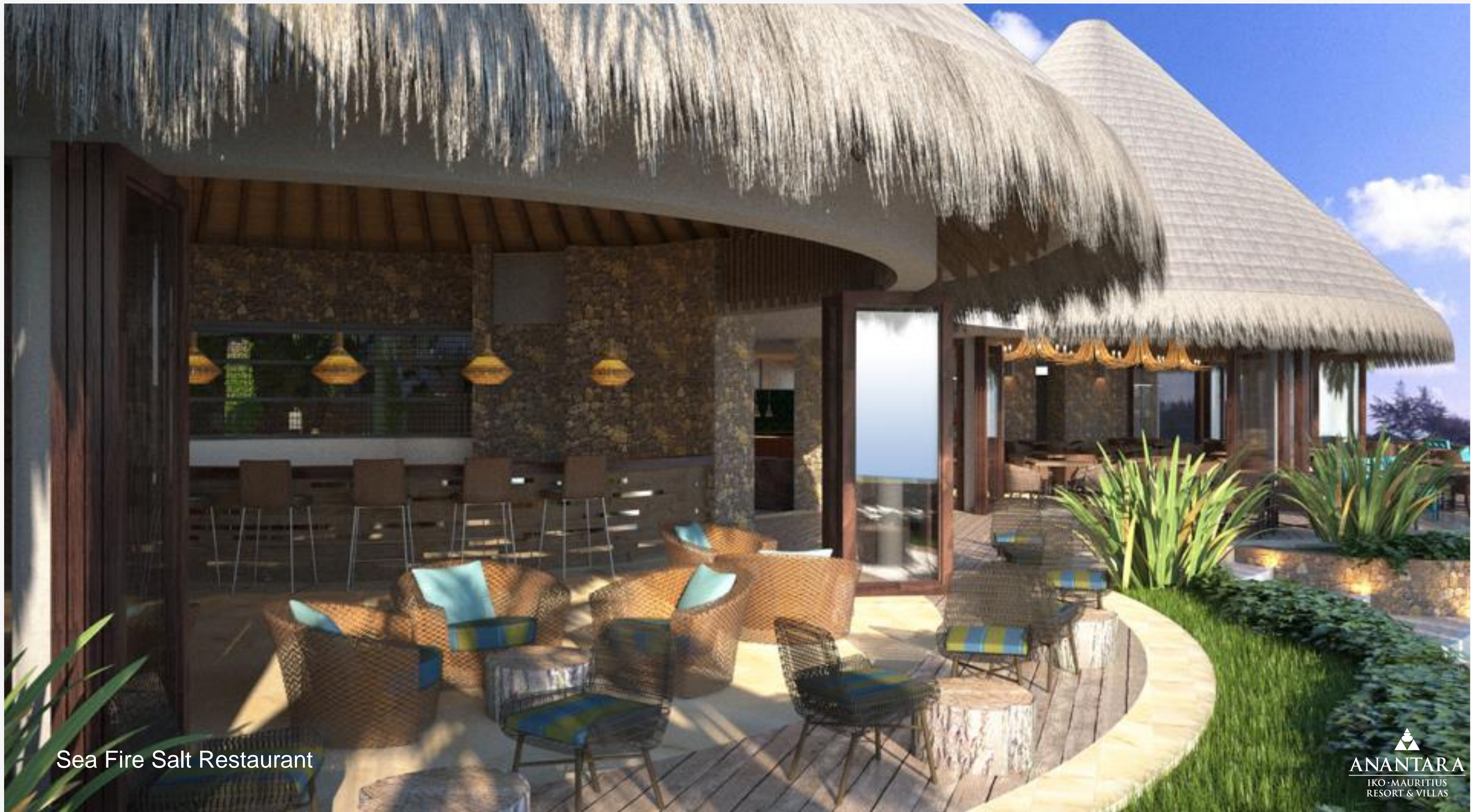
Sea Fire Salt Restaurant