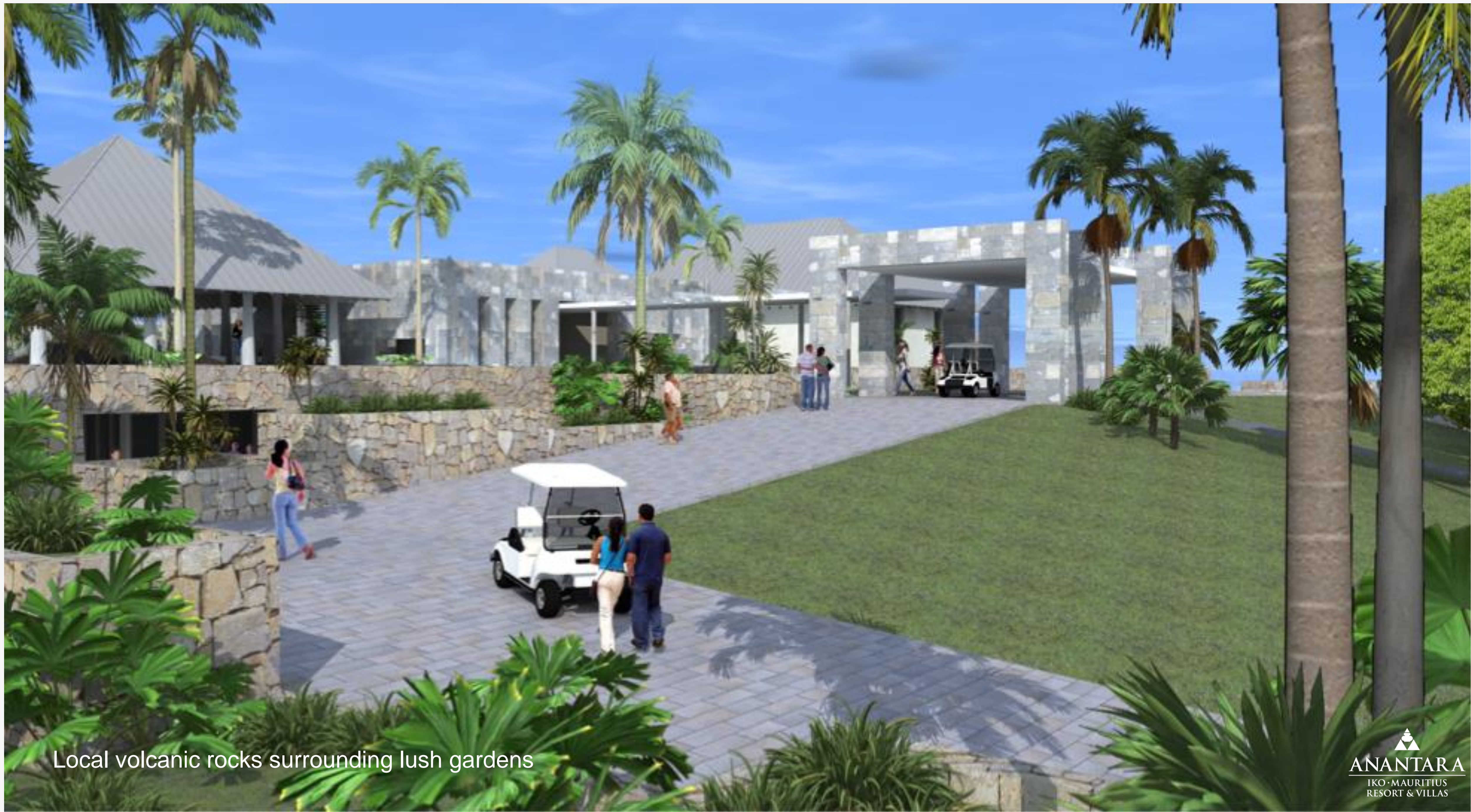
Local volcanic rocks surrounding lush gardens