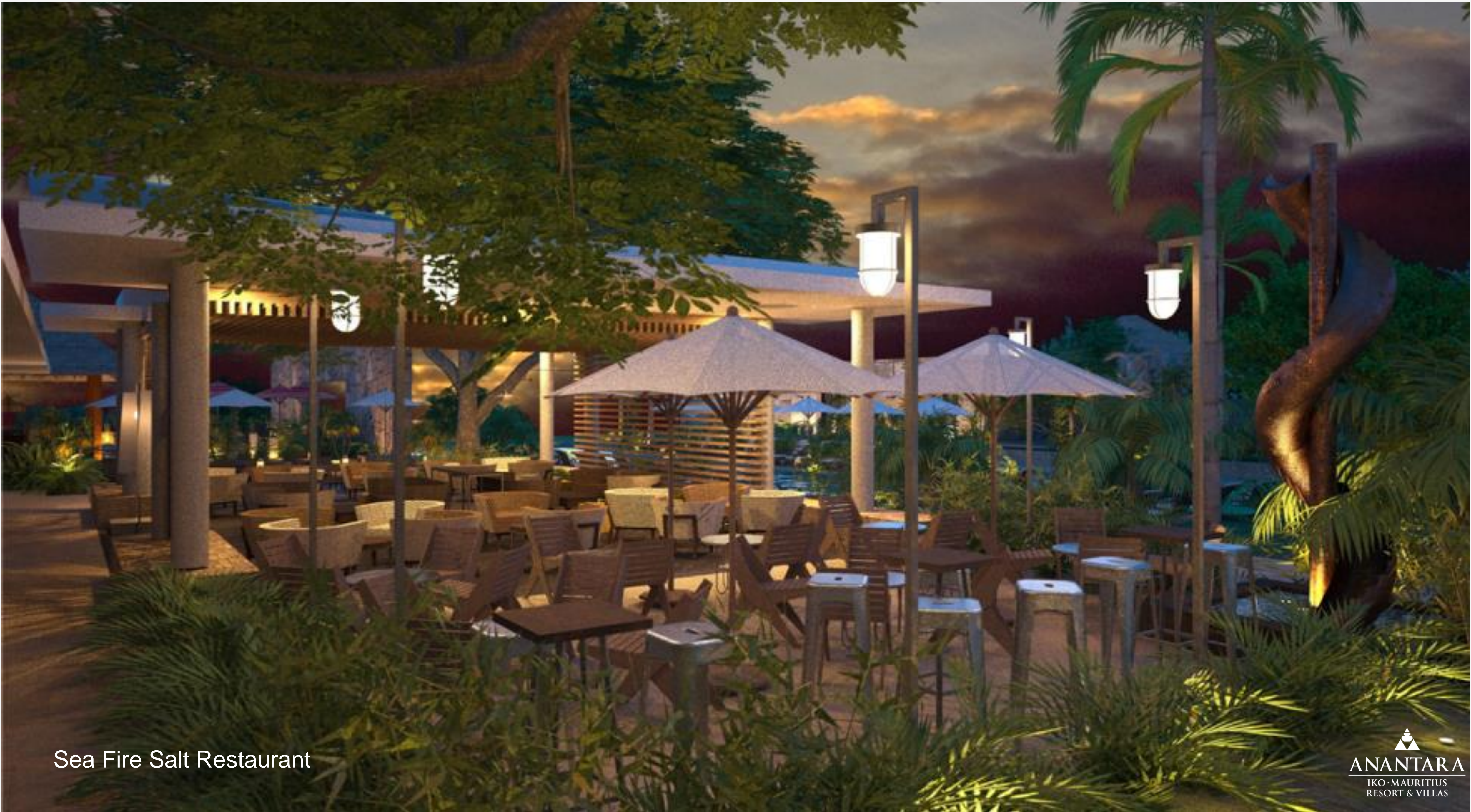
Sea Fire Salt Restaurant