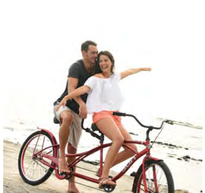
DISCOVER THE VILLAGE ON A TANDEM