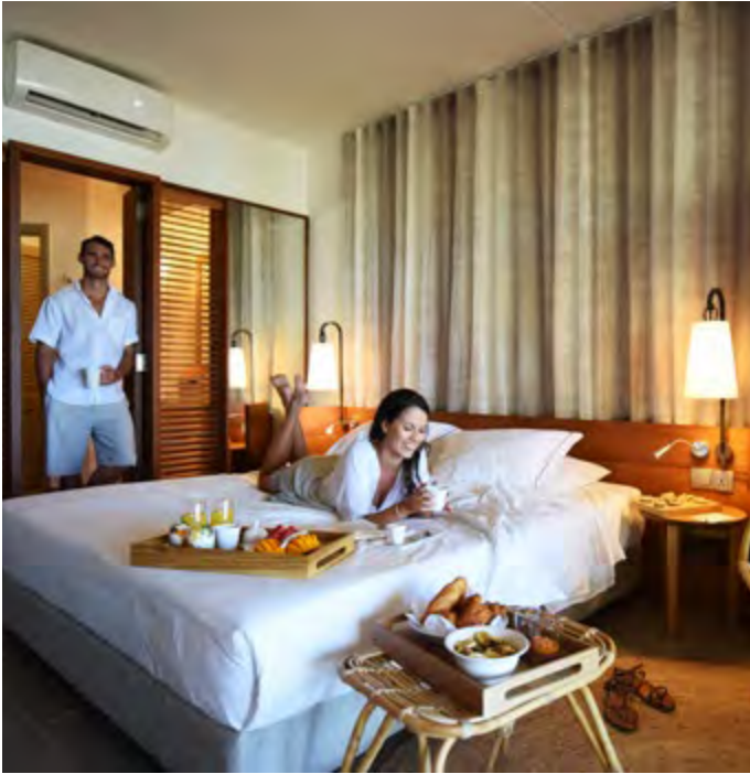
ALL DAY BREAKFAST IN ROOM