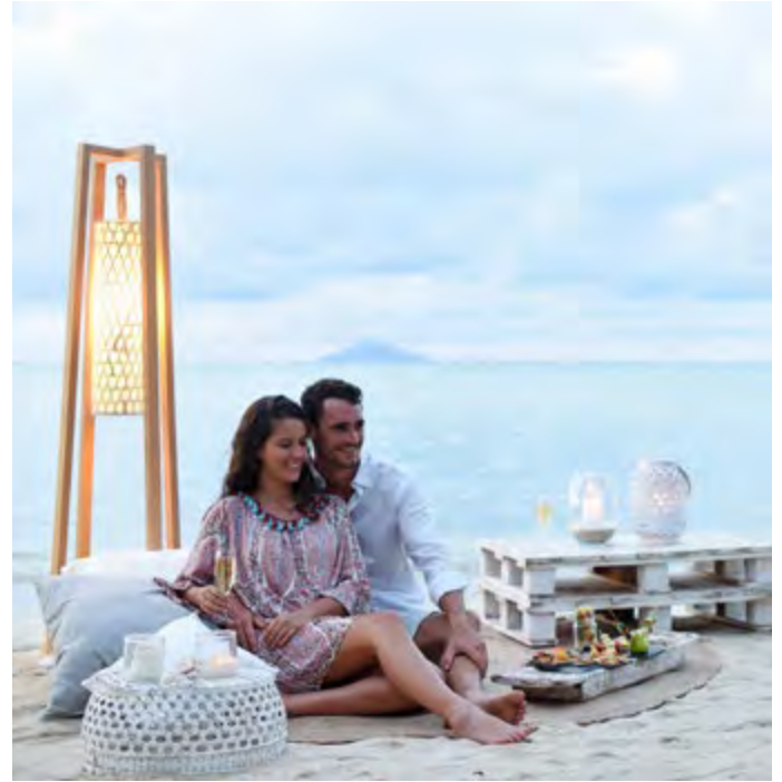
APEROMOMENT ON THE BEACH