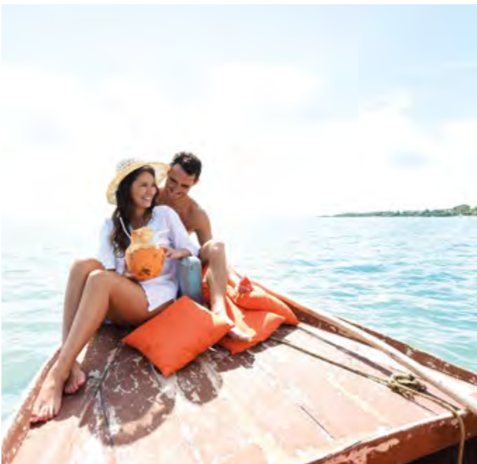
EMBARK FOR A PRIVATE CRUISE ON A TRADITIONAL PIROGUE