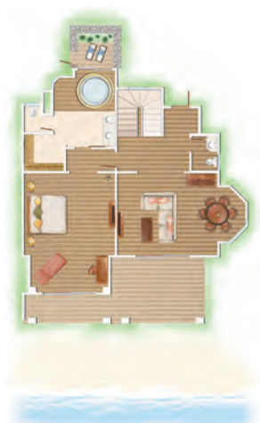
Family Suite (ground floor)