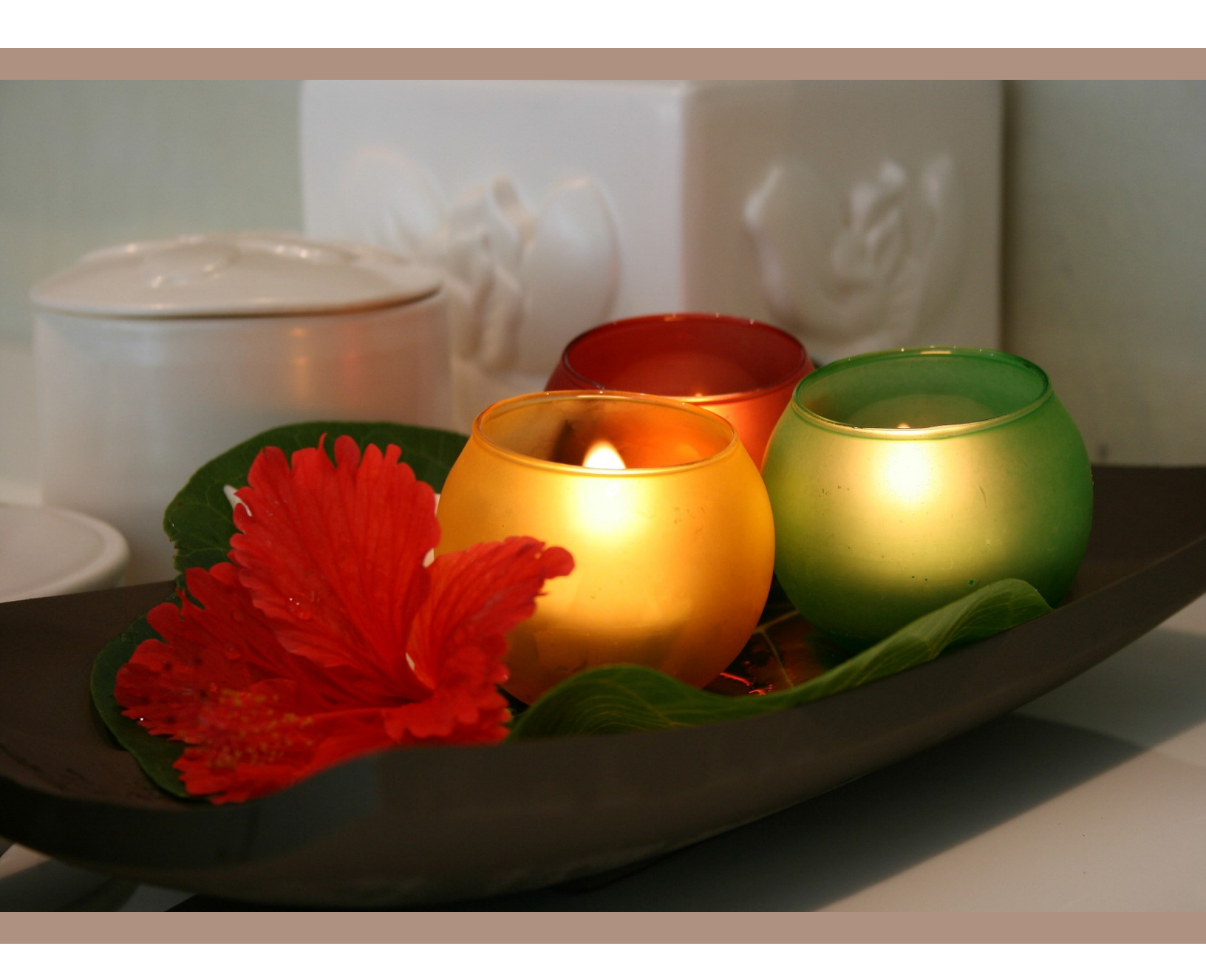
pure essence of ultimate wellbeing