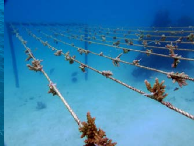
Coral Rope Nursery After 9 Months