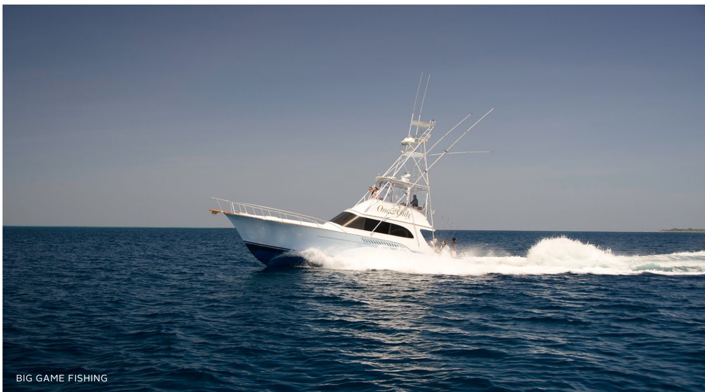
BIG GAME FISHING

Charter your own private boat or enjoy our excursions with privacy.